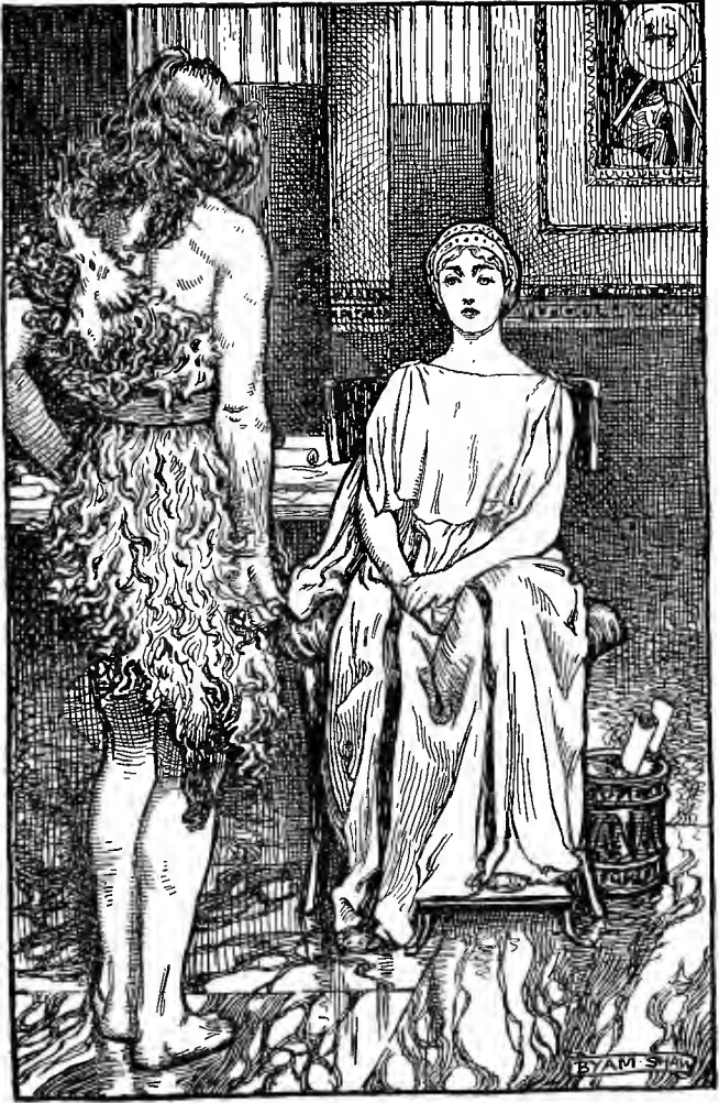
HYPATIA AND PHILAMMON